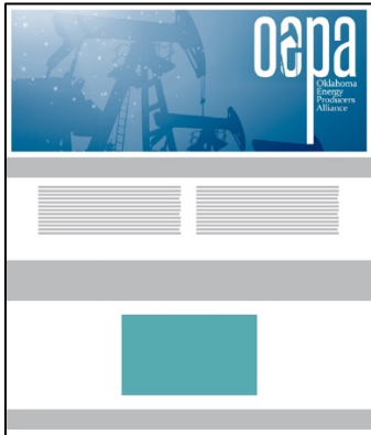
HOMEPAGE BANNER 710 X 375 pixels